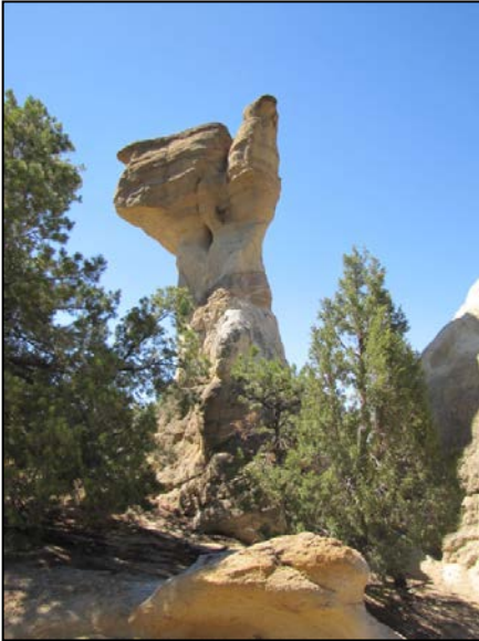
Thumbs-Up Hoodoo (Map # 1)

Recorder: Edward Kotyk Date: 2014 Aug Latitude: 36.8104 Longitude: -107.871 Comments: From the north looks like a "Thumbs up"