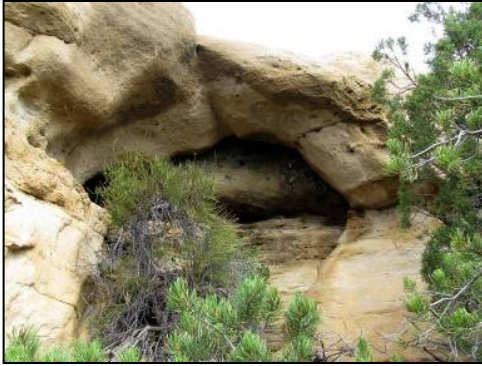
NM-592 (Map # 17)

Type: Pothole Arch Classification: Minor Recorder: Edward Kotyk Date: 2013 Sept Span: 8 ft Height: 4 ft Separation: 0.5 Latitude: 36.811621 Longitude: -107.870029