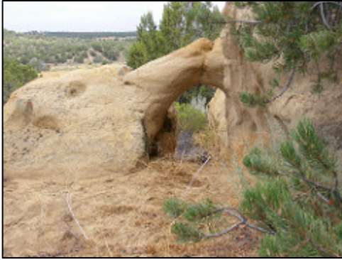
NM-551 (Map # 13)

Type: Irregular Arch Classification: Miniature Recorder: Keith Lund Date: 2017 July Span: 3 ft Height: 3 ft Separation: N/a Latitude: 36.788396 Longitude: -107.870174