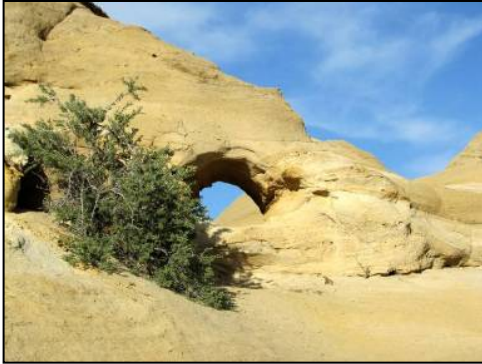
NM-108 (Map #9)

Type: Fin Arch Classification: Miniature Recorder: Larry Beck Date: 2003 May Span: 2 ft Height: 2.5 ft Separation: N/a Latitude: 36.789895 Longitude: -107.869739