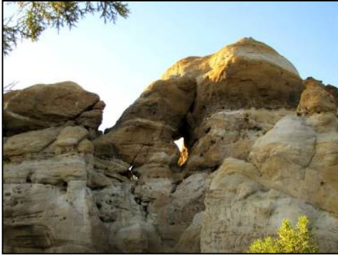
NM-104 (Map #5)

Type: Fin Arch Classification: Miniature Recorder: Larry Beck Date: 2003 May Span: 1.5 ft Height: 3.5 ft Separation: N/a Latitude: 36.78517 Longitude: -107.869349