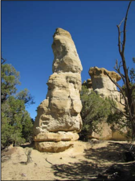
Hoodoo (Map #3)

Recorder: Edward Kotyk Date: 2014 Aug Latitude: 36.8118 Longitude: -107.879 Comments: Pectoglyph nearby.