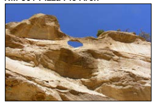
NM-301 Pizza Pie Arch

County: San Juan Latitude: 36.562494 Longitude: -107.747798