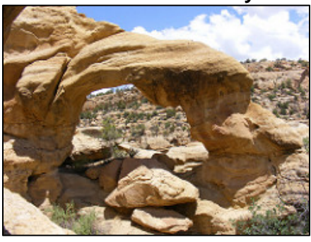
NM-203 Gobernador Canyon Arch

Type: Fin Arch Date: 2009 July