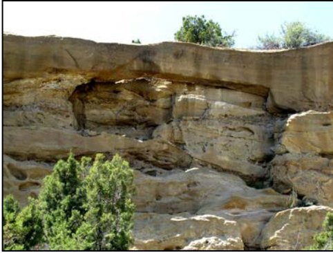
NM-294 (Map #1)

Type: Pothole Arch Classification: Minor Recorder/Photo: Edward Kotyk Date: 2011 May Span: 15 ft (est) Height: Not recorded Separation: 1 ft Latitude: 36.777069 Longitude: -107.810641