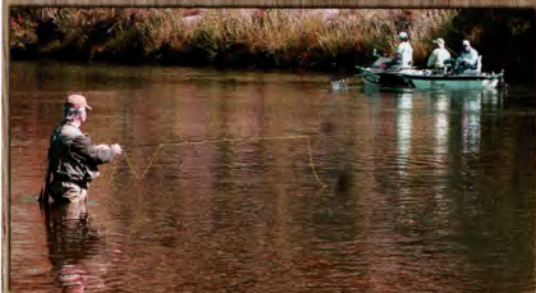
WORLD CLASS FISHING